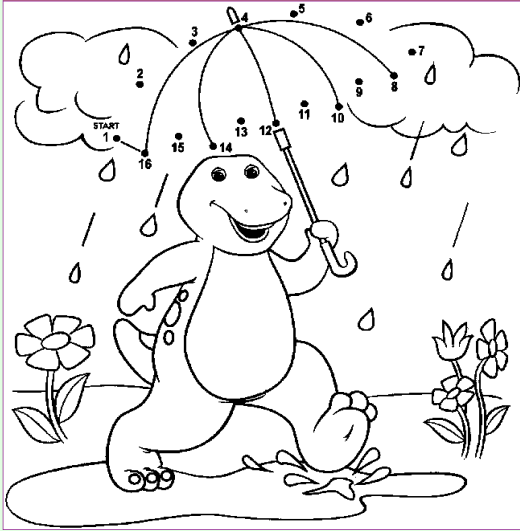
Join up the Dots