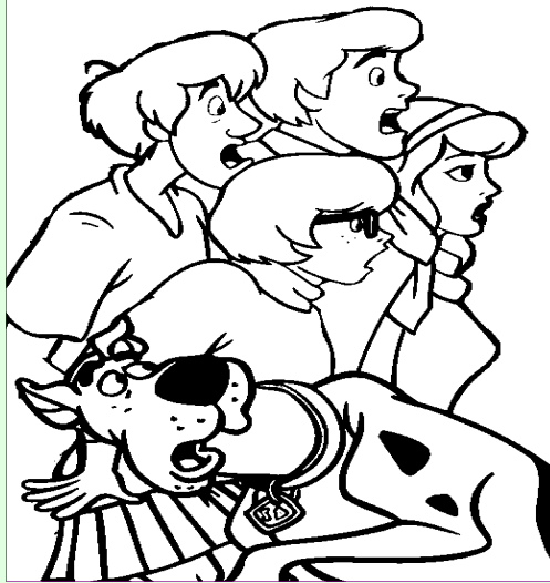
Colour in the Scooby Gang