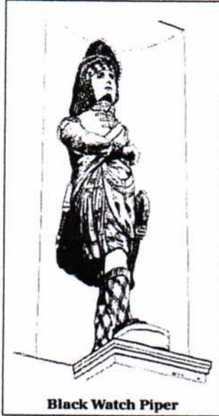
Black Watch Piper

The hotel remained an important stopping off point, for those using the main coach route for Glasgow & Edinburgh to Inverness and Aberdeen. At the side of the hotel where the present day goods entrance is situated, would have been the entrance for the coaches. The facade of the main entrance was actually constructed in the 1800's. The large Victorian style window and pillars were designed by Sir Robert Reid, the then King's architect for Scotland. Underneath Reid's bar are the remains of what were ovens or kilns.