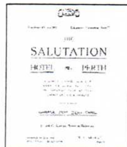
Adverts from 1949